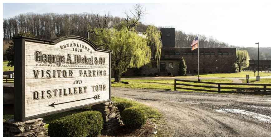
Cascade Hollow – George Dickel Distilling