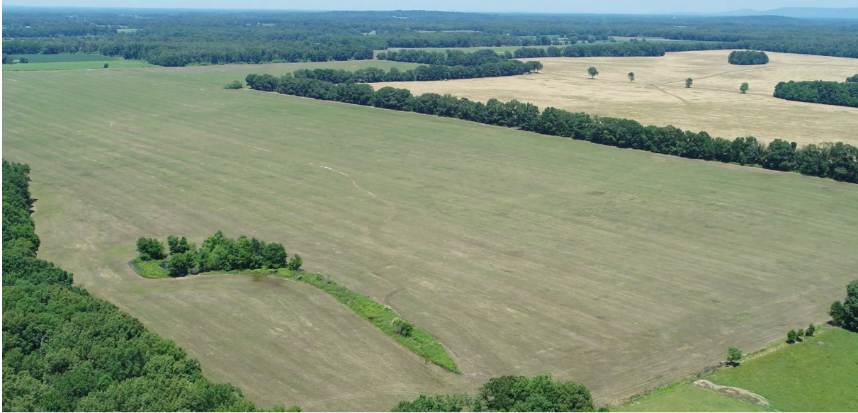
I-24 Industrial Site